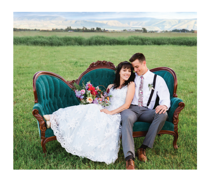
OME, EXPERIENCE the serenity & peace that abides at Brightside Vintage Farm!